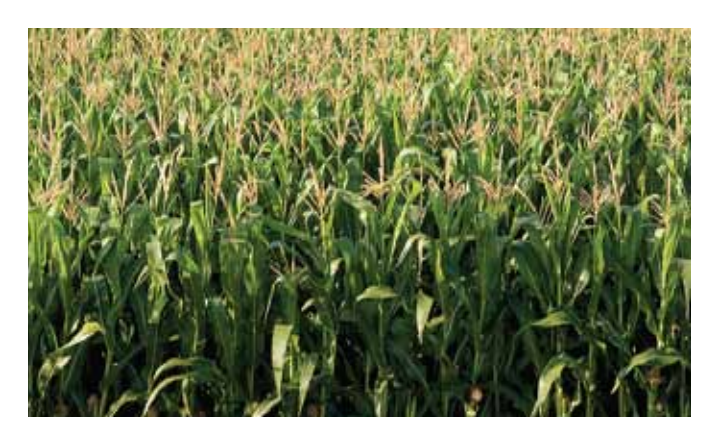
Corn Valued at $7 billion annually, corn covers 7.3 million acres in Minnesota, making the state fourth in U.S. production. Yields have changed from 39 bushels/acre in 1959 to 146 bushels/acre in 2007, due to cold-hardy varieties produced especially for Minnesota. U of M introductions account for nearly 200 hybrids. In 1992, TIME magazine designated hybrid seed corn as one of the most significant events that shaped our world during the past 1,000 years. Corn has more than 3,500 uses in commercial and industrial products and manufacturing processes.