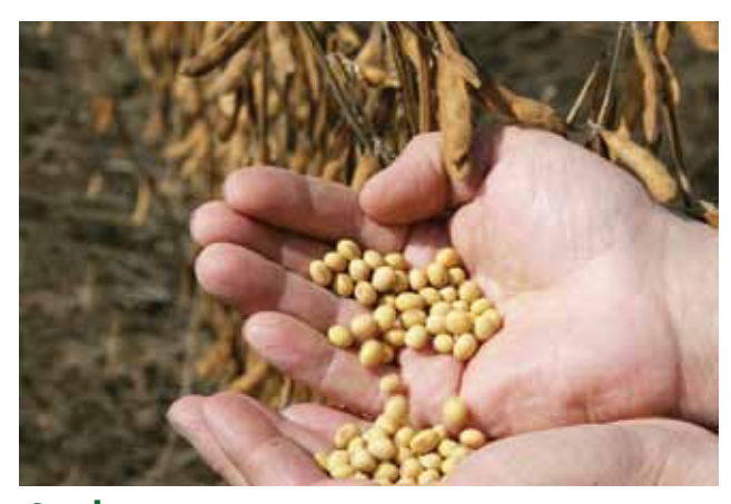
Soybeans Valued at $3 billion annually, soybeans cover 7.3 million acres in Minnesota. Originally grown as forage, the seed and oil crop was developed by researchers at the U of M. Soybeans are an excellent source of protein: Each seed is 40 percent protein, compared with 25 percent for other legumes, and 12 percent for other cereal grains. Soybeans' uses range from livestock food for poultry and Minnesota's 49 million turkeys, to baby formula, adhesives, oil products and more. Minnesota is third in U.S. soybean production.