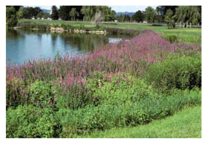
Purple loosestrife Originally planted as an ornamental garden plant, purple loosestrife is the poster child of invasive plants. It has taught us how significantly a plant can transform the valued wetlands and waterways in Minnesota. Careful management with biological and chemical controls, along with education, and cooperative measures, learned from purple loosestrife should help us deal with other invasive plants in the future.